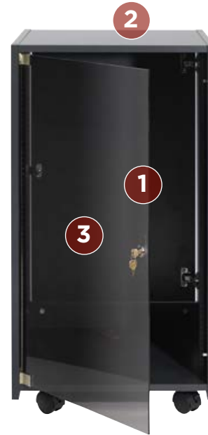
Shown with optional Plexi front door and optional wooden rear door.