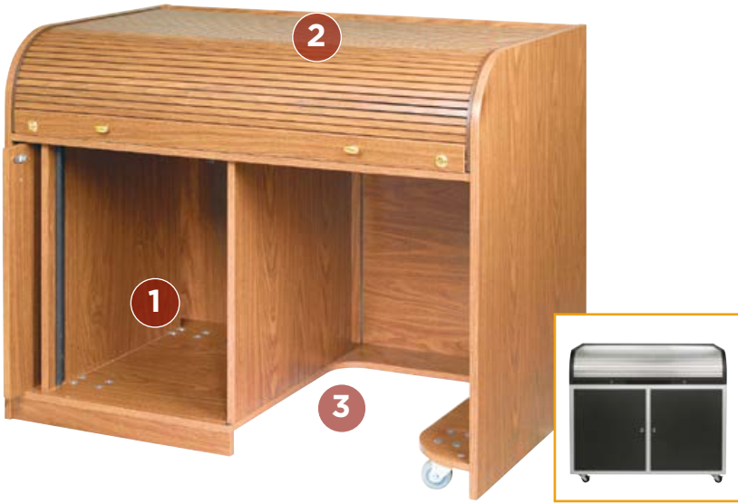
ERT-CH Cherry Finish.