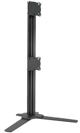
K3F120 FREESTANDING MOUNTED 1x2 ARRAY