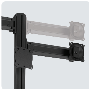
Independent Height Adjustment