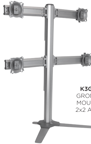
K3G220 GROMMET MOUNTED 2x2 ARRAY

Compatible with VESA® 75 x 75 mm and 100 x 100 mm patterns