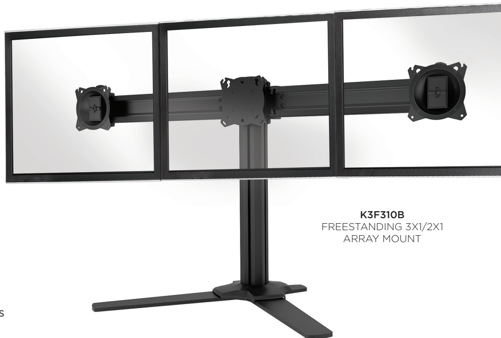
K3F310B FREESTANDING 3X1/2X1 ARRAY MOUNT

Heavy Duty Design – Sleek, solidly constructed arms with attractive color accents. Available in black and silver.